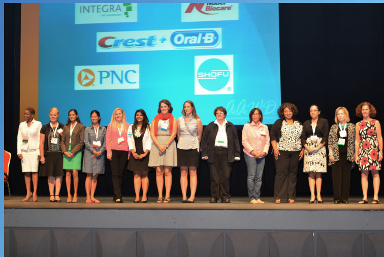
The newly installed 2015 AAWD Board of Directors