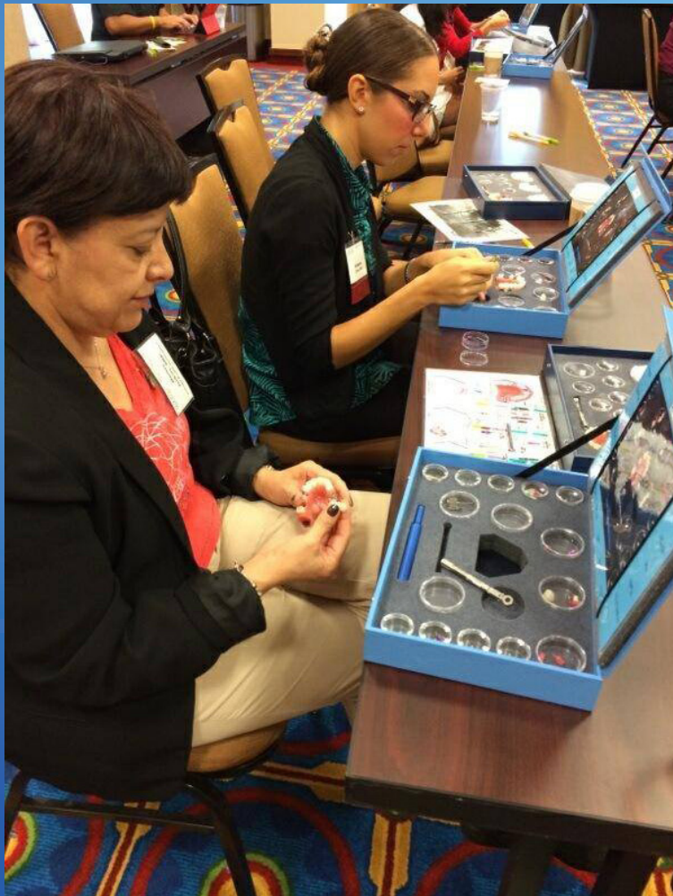
Hands on Class Sponsored by Zimmer