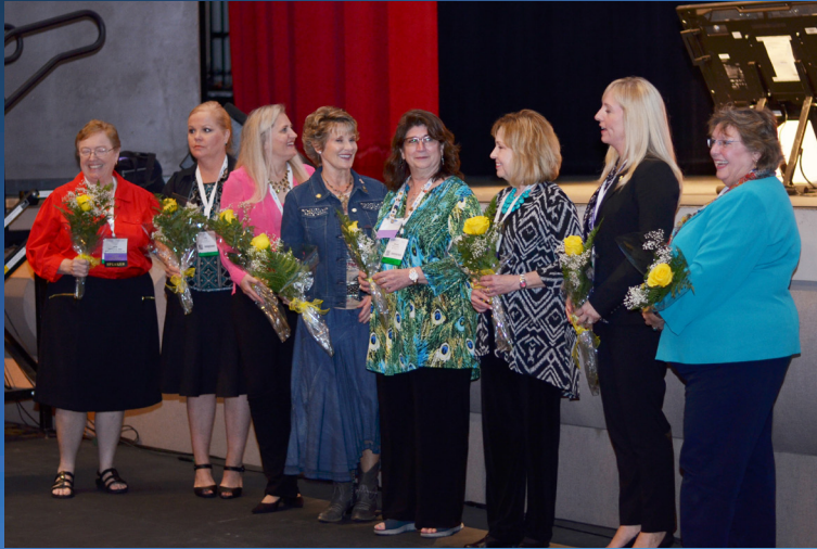
AAWD Past Presidents in Attendance