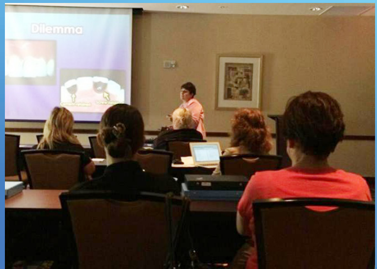
Hands on Class Sponsored by Zimmer