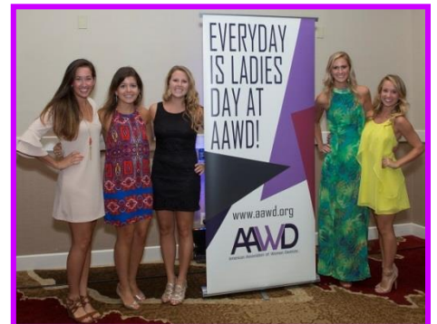
Several students enjoy the AAWD Awards Dinner at the 2017 Conference.