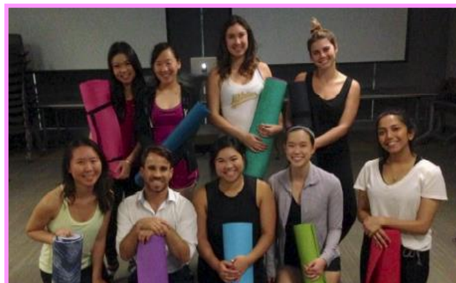
Pictured above are participants in the University of the Pacific Fundraiser for Take Back the Night.