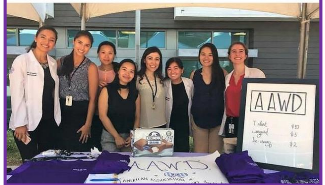
Above are pictures from Fall Club Day, during which AAWD members at WesternU recruit incoming students to join the chapter.