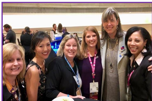
The Women's Reception at the 2017 ADA meeting in Atlanta, Georgia.