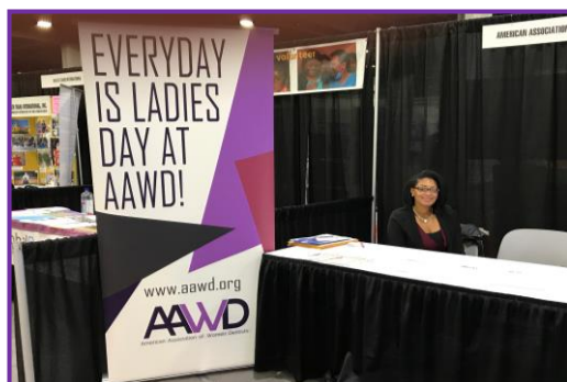
AAWD at the 2017 ADA Meeting in Atlanta, Georgia.