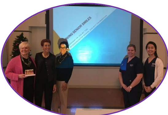
The first Massachusetts Dental Society Foundation grant event "Saving Senior Smiles" held at Brookline Senior Center on November 14, 2017.